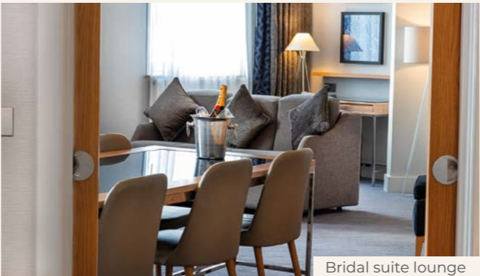
Bridal suite lounge