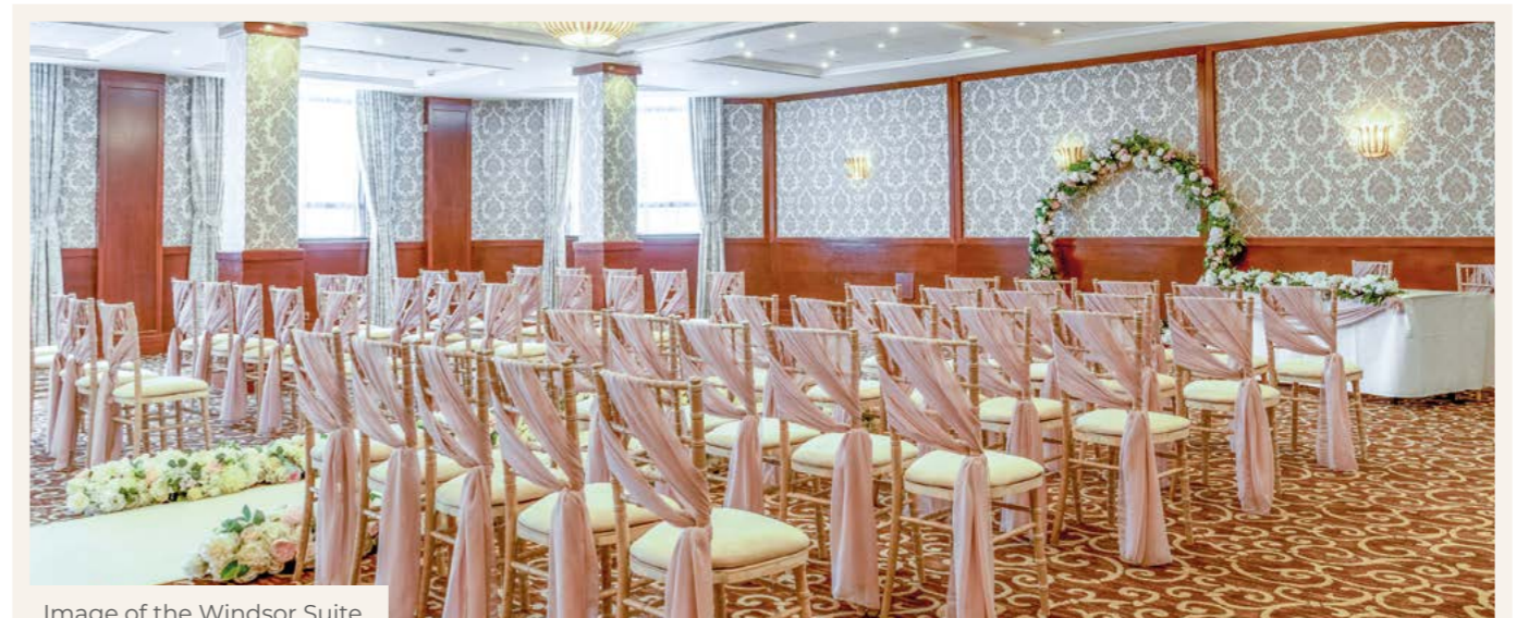
Image of the Windsor Suite

We have two main rooms available for ceremonies, each individual in design and offering options to suit every budget, style and guest list.