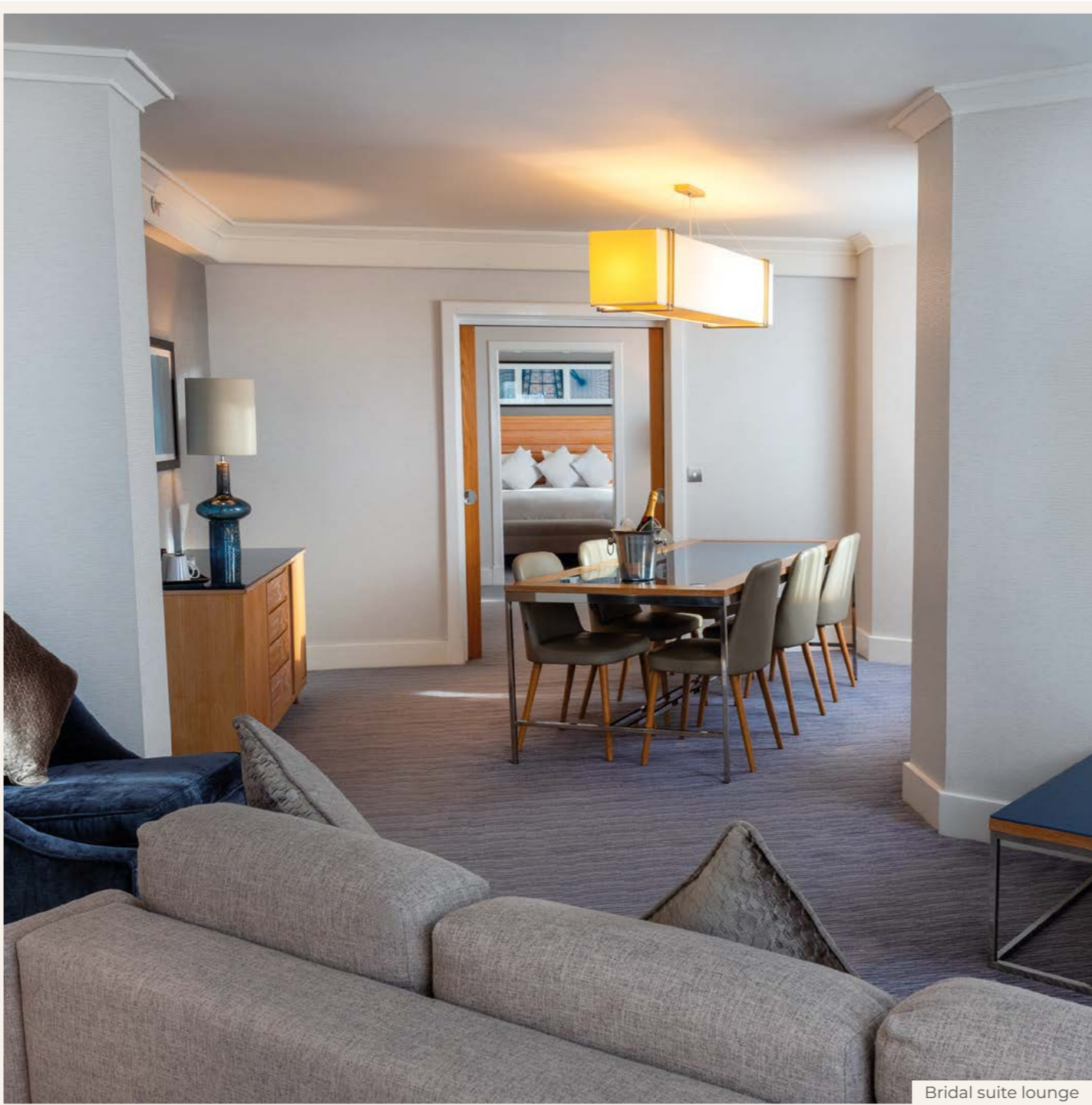
Bridal suite lounge

With 278 en-suite bedrooms, including the bridal suite, 63 deluxe rooms and 4 suites, and a variety of room types to choose from, your guests can enjoy modern facilities, comfortable beds and stunning sea views.