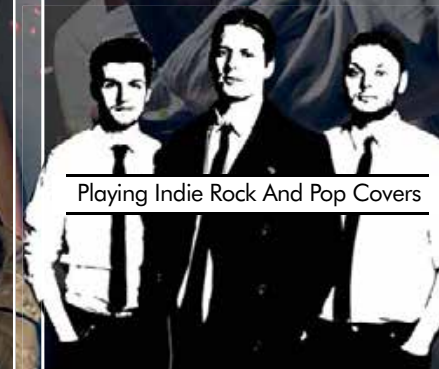
Playing Indie Rock And Pop Covers

ROYAL CHRISTMAS PARTY WITH TRIBUTE ACT & DISCO